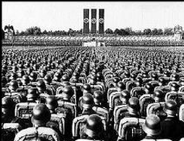
What other gamers think I do.