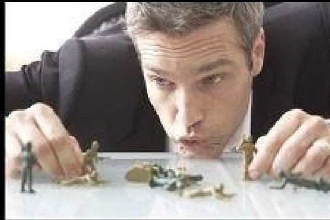
What my mom thinks I do.