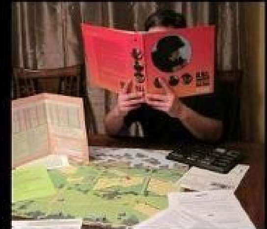
What I really do.