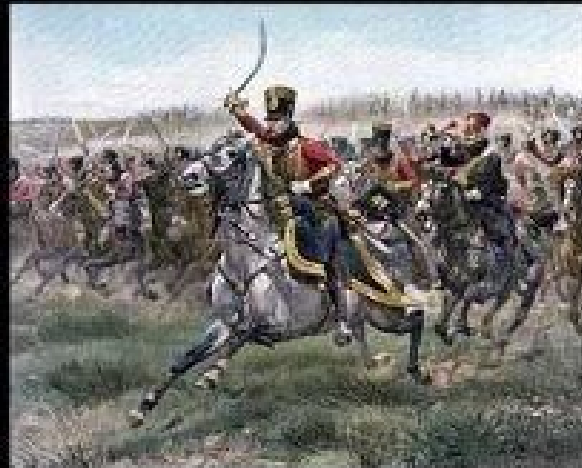
What I think I do.