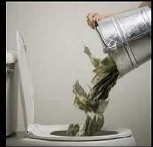
What my spouse thinks I do.